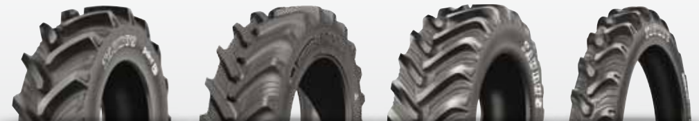
POINT 8 POINT 70 POINT 65 RC 95